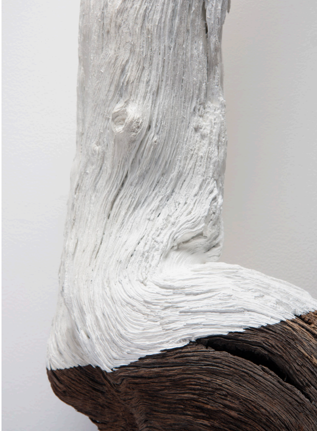
Trent Burkett, Mesquite with Paint (detail)

The Museum of Art presents Etcetera , an exhibition of sculpture and drawings by Arroyo Grande artist Trent Burkett on view from August 5 until October 2, 2016.