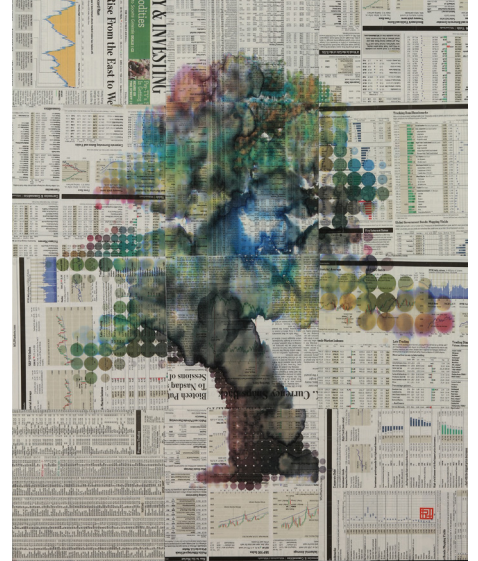
Phillip Hua, Euphorbia (detail), ink and tape on Wall Street Journal on Dibond

Related programming includes a ceramics workshop for adults at Trent Burkett's City Art Plant studio October 21 – 23. SLOMA will also screen a documentary film on Japanese potter Ken Matsuzaki on Monday, September 19 at 7 PM. ♦