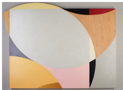
Erik Olson, Cycles of Life — Color Fields

Eye Matters is a collection of paintings and photography by Nipomo-based artist Erik Olson. The exhibition will feature compositionally abstract paintings on wood alongside photographic images juxtaposing the built and natural