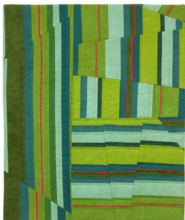
Gay McNeal, Out of Line