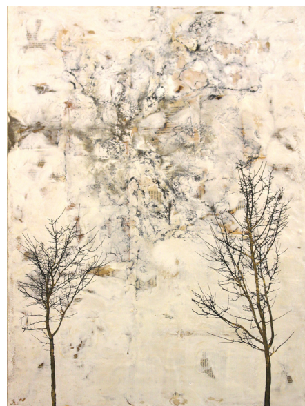
Shannon Amidon, The Space Between , encaustic and mixed media

The Museum is also offering an encaustic workshop with Texas-based artist Michelle Belto, January 29–31. Sign up online. ♦