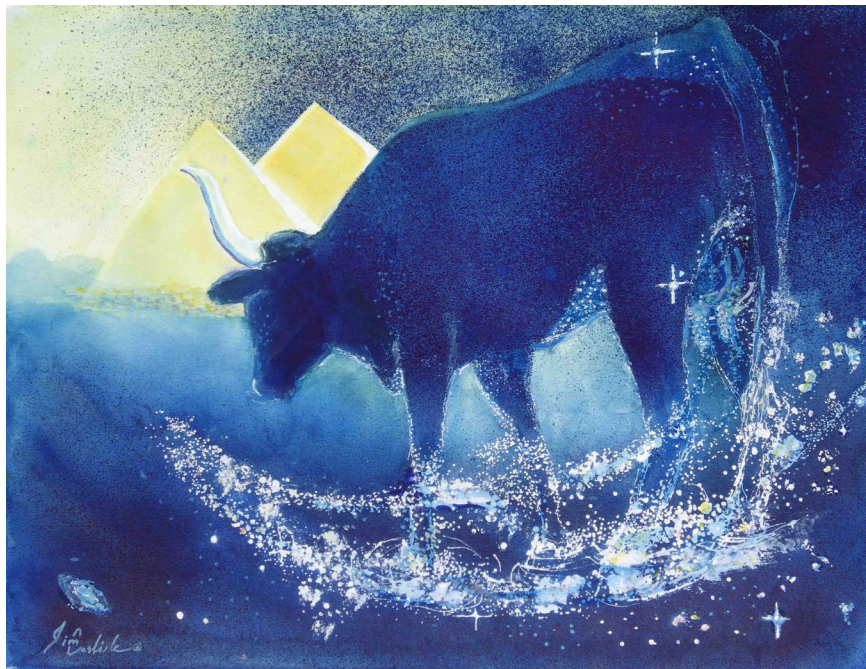
Jim Carlisle, Sky Cow , watercolor

The San Luis Obispo Museum of Art, in conjunction with the Central Coast Watercolor Society, presents Aquarius 2016 , a Pacific regional exhibition of the best in watercolor, opening on February 5.