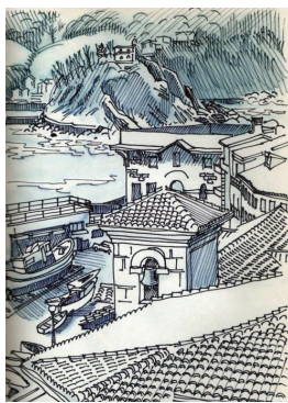
Port of San Sebastian (detail)