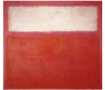
Mark Rothko, Pink and White over Red , 1957. From the Anderson Collection.

DETAILS // $115 members, $130 general includes Silver Bay motor coach, tickets, tours, and snacks. Convenient pick up locations going north, beginning in Morro Bay. A detailed itinerary will be emailed to registered travelers. Purchase your trip online or call SLOMA. ♦