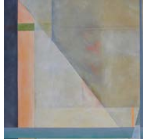
Jeanne Obermeier, Sangre de Cristo , acrylic on canvas, 42 x 42 inches, selected for Brushstrokes 2015