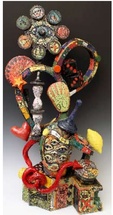
Tiffany Schmierer Cannot Predict Now , ceramic

International travel and relocations from England to Central Africa at a more page 6