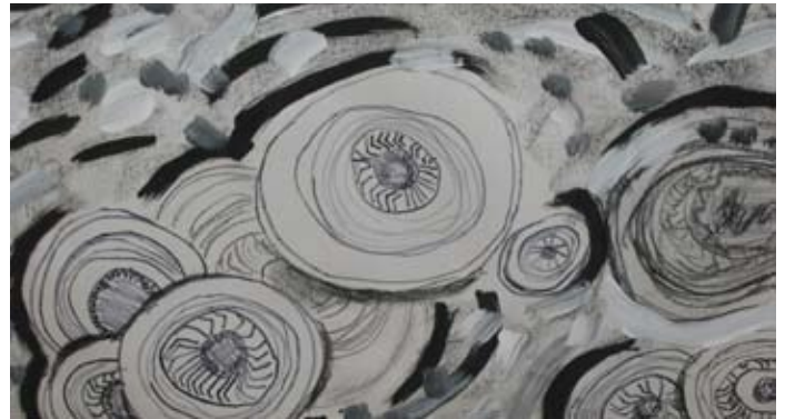
Ink drawing by summer camp student 2010

Plan to get paint splattered and bring something nonalcoholic and cool to drink. It's gonna get hot!