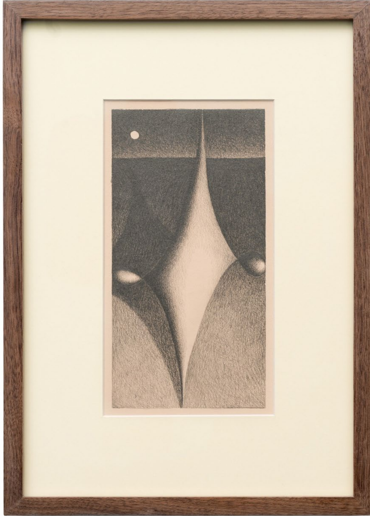
Alicia Adamerovich, Pin drop , 2025, graphite on paper, 8 x 4 1/4 inches, framed 14 x 10 inches

Alicia Adamerovich Pin Drop , 2025, graphite on paper 8h x 4 1/4w in 20.32h x 10.79w cm