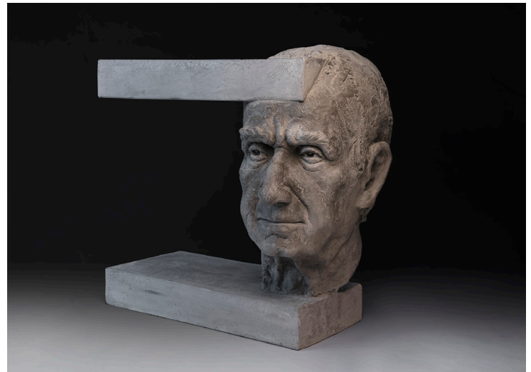
Yves, Goyatton, The Weight of Time , cement

California Sculpture SLAM showcases current works by established and up-and-coming California sculptors. The exhibition's goal is to provide a platform for a wide variety of concepts and materials.